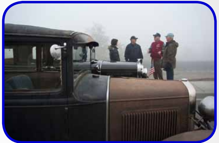
Photos above show some of the participants in and out of their cars waiting for the parade to start.