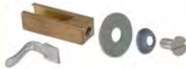
Brush holder set