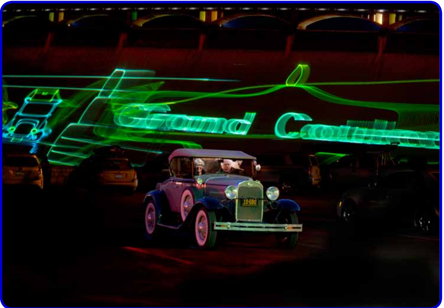
Blaine and Bev McGillicuddy are at Grand Coulee Dam during the light show with their 1931 Model A Ford Deluxe Roadster.

Reata Springs Baptist Church 2830 Leopold Lane, Richland, WA January 12th, 7:00 p.m.