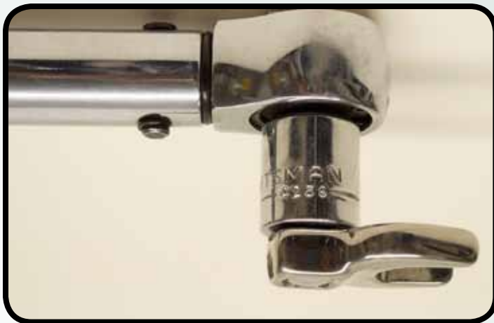
Side View: If L2 = 12" + 6" = 18" Total Length. Then M1 = 2/3 M2