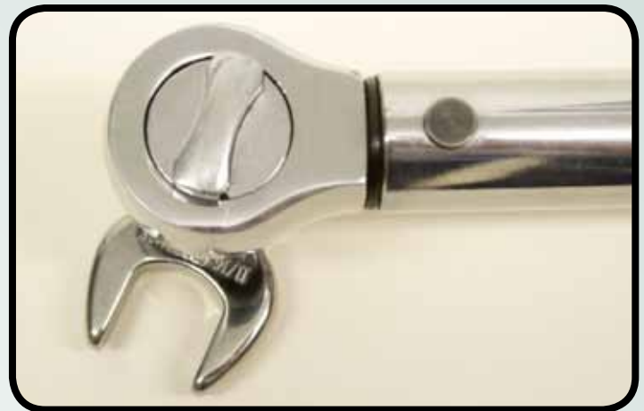
Top View: Lever is at ~ 90°, M1 = M2 .

The purpose of the club shall be to serve as a medium of exchange of ideas, information and parts for admirers of the Model A Ford, and to aid them in their efforts to restore and preserve the car in its original likeness. Membership in the Model A Ford Club of America is a requirement to joining the Columbia Basin Chapter. To join MAFCA, see the web site at www.mafca.com and click on the “Join MAFCA” tab. Requirements for membership in the chapter shall not insist upon the actual possession of a Model A Ford, merely an interest in the objectives of the club and a desire to take an active part in club activities shall be the primary requirement for membership. (Excerpt from Columbia Basin Model A Club Bylaws dated February 2015.)