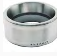
Special pinion outer race double sided