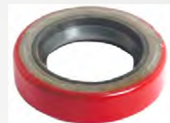
Axle housing inner shaft seal