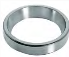
Rear axle bearing