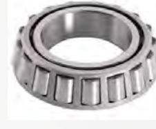
Timken tapered roller bearing