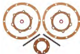
Torque tube gasket set