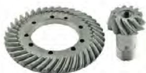
Ring gear & pinion gear