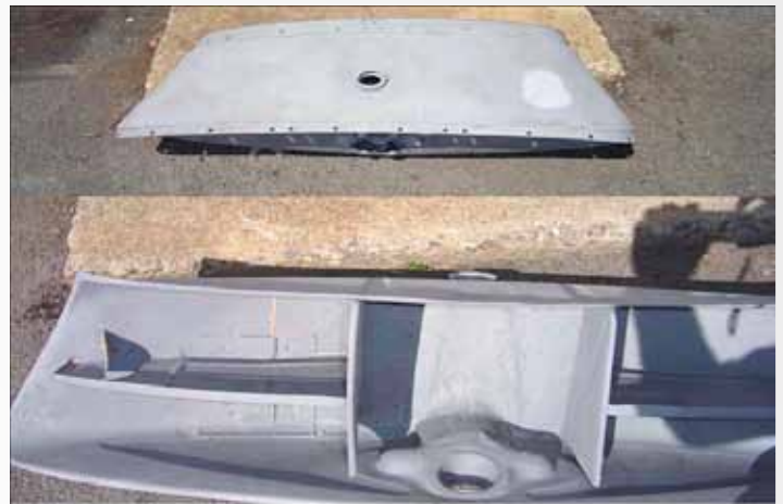
30-31 Gas Tank Cut Open