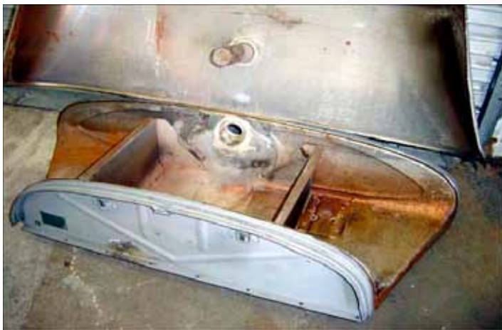
28-29 Gas Tank Cut Open