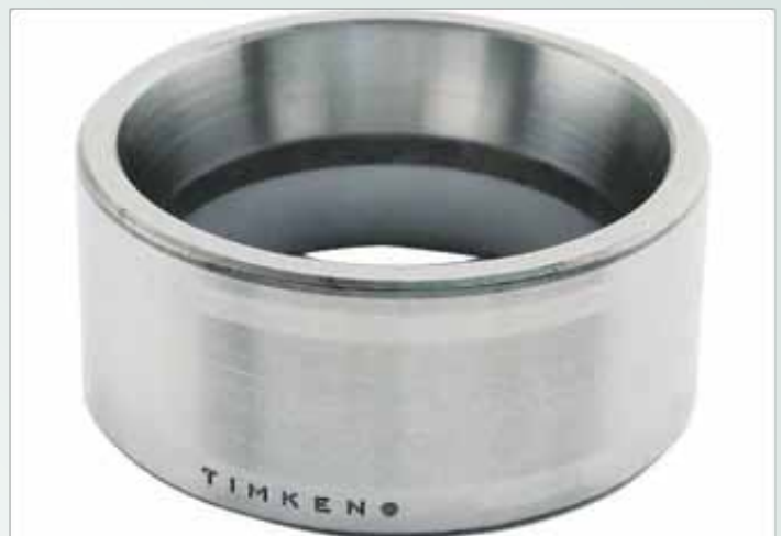
Special Pinion bearing dual cup one-piece setup. Similar to placing two cups back to back.