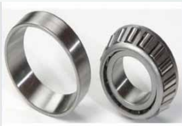
Tapered Roller Bearing & Race (cup)

NOTE: Wheel bearing failure causes: Not being adjusted right, contamination or loss of grease.